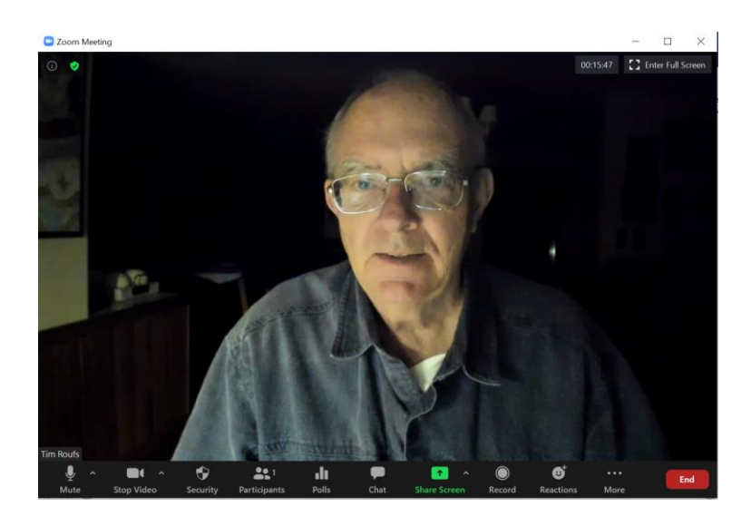
Live Chat is optional.